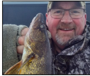
A 2018 winter walleye on a Brainerd area lake!!

Another season has come and gone in our great state. The hardwater fishing for walleyes and pike closed in February as our cold winter wanes, the panfish action usually picks up. Here at TIP, the action picked up this winter with a series of sport shows and a few decisions from the board of directors that we will highlight throughout the newsletter. I personally enjoy going to shows, meeting new people, and talking TIP with those that take a genuine interest in what we do, and why. Bottom line, as the program continues to provide the ability to report violations, we continue to refine processes, programs, and the internal operations to be more effective in our environment.