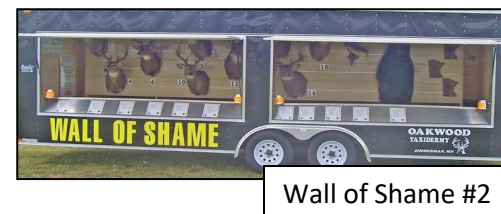
Wall of Shame #2

For more information, if you or your group would like to contribute to the wall replacement, contact our TIP state headquarters at 218-326-8477 or talk with one of our board members. We will be keeping our contributors informed at the TIP website: www.turninpoachers.org .