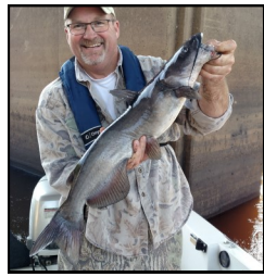
A fall of 2018 Mississippi catfish taken near Brainerd!!

Like most of you, I have had opportunity to be a part of a group or organization that promotes a reason and/or purpose. As we know, TIP has that mission and purpose of “curbing the illegal taking of Minnesota’s fish, wildlife, and natural resources”. Many years ago, the fall season was used to “harvest” for food during the long winters we endured. Times have changed. For most of us, the fall season is still a time of harvest and preparation, but the need for food and storage is less complex and we have access to food down the street at our local market. In this